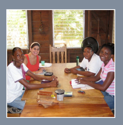
Bible study in Belize